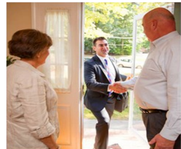
Find the Right Policy for You and Your Family