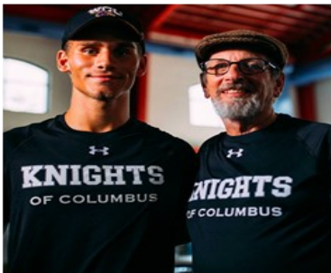
Join the Knights

Remember, long-term care policies are underwritten based on your health, and you most likely will never be any healthier than you are today.