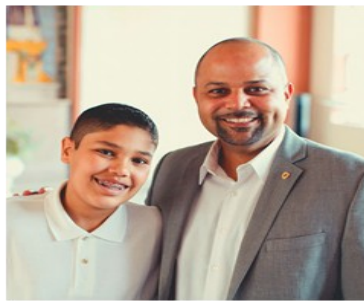
Meet with your Agent