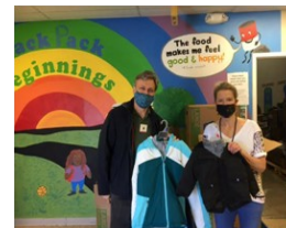
Coats For Kids